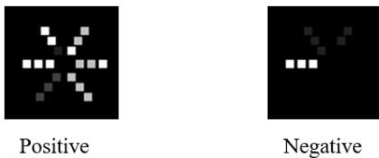
Figure 4: Best performing images generated for positive and negative values.

As a result, in the image we get three squares placed on six axes ordered with an increasing SOFA score on each axis with an increasing order of date of measurement. In this method we take into account how many of the organs are severely damaged. You can find a typical positive and negative value image in Figure 4. One can easily notice that as the SOFA scores increase for a patient snowflake shape becomes more apparent.