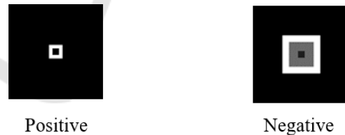
Figure 3: Image generation with concentric square frames.

In Figure 3. we represent another trial we create concentric square frames on a 69-pixel by 69-pixel canvas each frame represents total SOFA score of the patient calculated for every category in every eight hours. Whiteness of the frames decreases as the SOFA score of the organ increases and greys out as the SOFA score increases. This image generation algorithm is not helpful on creatin a CNN model with high AUROC values we discarded this image generation approach.