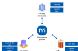
Figure 2: Business working relationships.

It is required to implement the rights and responsibilities of each department through the construction of the platform. Through the hierarchical design of the platform account and authority, the management responsibilities will be delegated from top to bottom and implemented layer by layer, and the monitoring data will be reported from bottom to top and evaluated layer by layer. Through the role definition, the oversight of the department of health, the lead agency director duties, grassroots organization management responsibilities for the distribution platform, managing their hierarchy of data platform, the data flow between the layers by the platform automatically, each department only focus on the completion of the assessment criteria for the department and completes the corresponding supervision work, The business working relationship of each department is shown in Figure 2 below.