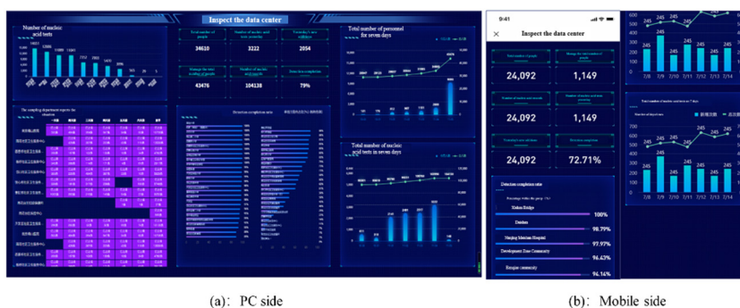
Figure 3: Customized tablet.

and department-based statistical data of all required checks in the whole area, as shown in Figure 3 (b) below. The performance assessment of the work required to be inspected is carried out, and the completion rate of the work required to be inspected is implemented in all departments. It can be seen that the overall completion rate of the work required to be inspected is completed in the whole district, as well as the work completion rate of each leading department. Accurate statistics of work.