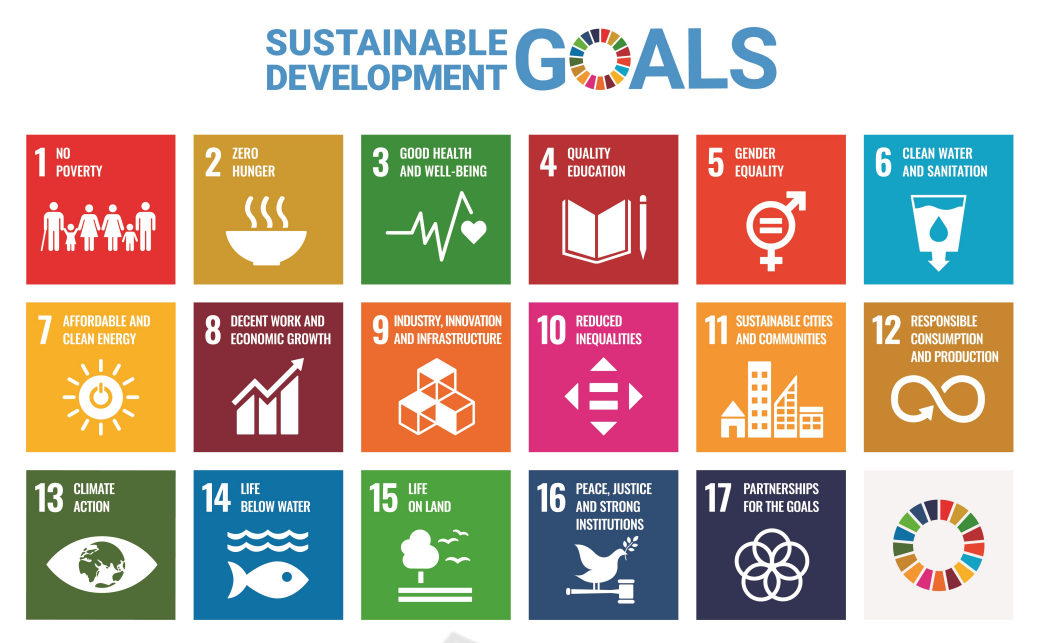
Figure 1: The 17 SDGs of the UN.

on SDGs and software and requirements engineering specifically. Based on an initial analysis, we see that there exists only limited work on studies or models that link the SDGs to software system development or software systems effects to the SDGs such as (Brooks, 2020). We are aware that we are drawing early conclusions, but these findings strongly motivated us to pursue the research described in this paper.