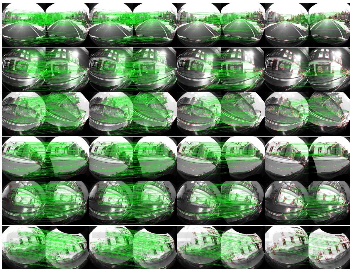
Figure 4: Qualitative results of feature matching on RobotCar images with k = 300 detected points. Nearest neighbour matches with a distance d \leq 3px are shown in green. From left to right: FisheyeSuperPoint, SuperPoint (DeTone et al., 2018), SIFT (Lowe, 2004), ORB (Rublee et al., 2011).