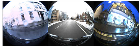
Figure 1: Example imagery of the Oxford RobotCar Dataset (Maddern et al., 2017), showing different weather and lighting conditions.