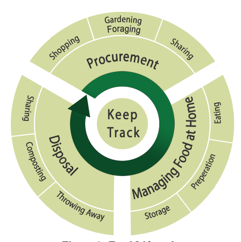
Figure 1: Food Lifecycle.

Thereby, consumption is accompanied by keeping track. For example, household budgets are used to keep track of finances (Comber et al., 2013) and diet and nutrition are tracked with diet trackers and food diaries (Achananuparp et al., 2018; Ahmad et al., 2016; Comber et al., 2013; Graf et al., 2015). Buying food products is usually done in supermarkets but also on farmers markets or through online delivery (Ng et al., 2015). Within shopping, lists are commonly used to prevent over-buying and ensure completeness of the basket (Ganglbauer et al., 2013, 2012; Ng et al., 2015). Thereby, shopping lists are often created in front of the fridge, ensuring to buy only necessary products (Ng et al., 2015). Besides, shopping is sometimes aligned to offers or vouchers (Ng