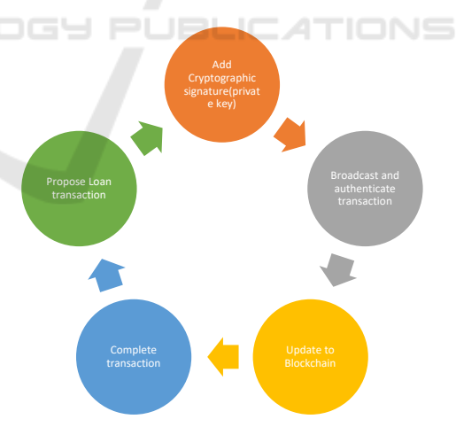
Figure 3: User management process.

The public key is used to create account addresses similar to bank identities or like account numbers in traditional banking. The private key will be required when signing transactions originating from the account (Figure 3). Each node on the network can verify its signature (Dingman et al., 2019; Zhong, Wu, Xie, Guan, & Qin, 2019).