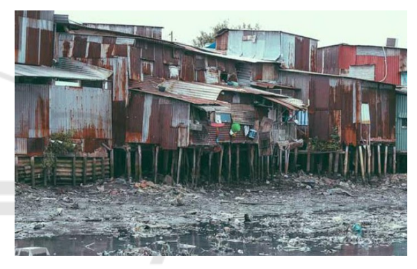
Figure 3: The slums in Ho Chi Minh city.

The reason is indicated by the hot growth in population, rapid urbanization and industrialization in recent years, which has put pressure on the water environment in river basins (Babut et al., 2019). The level of pollution of water sources in canals, rivers and lakes in big cities and concentrated population areas is very serious (Figure 3).