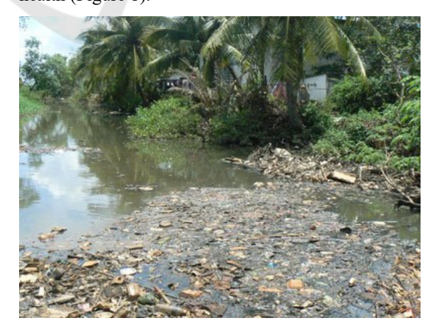
Figure 1: The status of river pollution in Ho Chi Minh city.

Although Ho Chi Minh City has implemented many solutions to reduce water pollution in the Saigon River basin over the years, up to now, the pollution is still in excess of the permitted level, affecting public health (Figure 1).