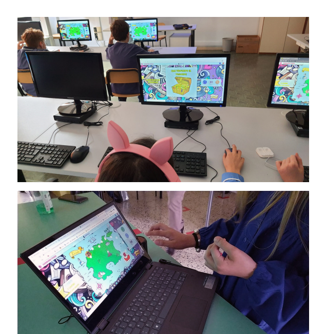
Figure 3: In-class activities during the pre-test phase.

RQ1 the evaluation of user performances for each song;