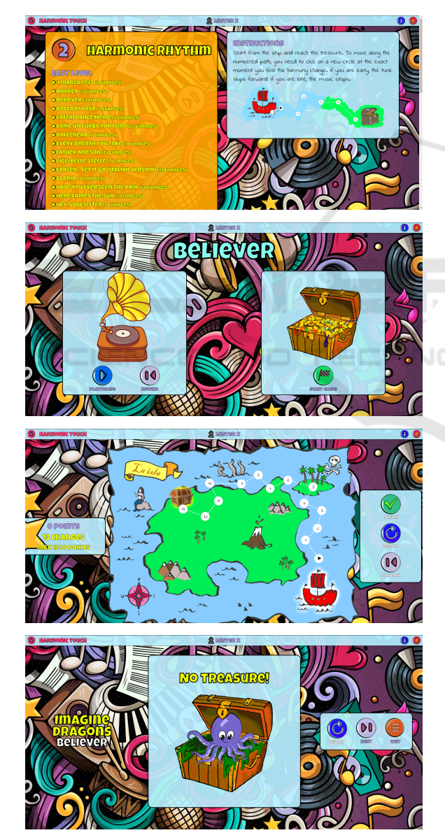
Figure 2: From top to bottom, the 4 steps for Experience No. 2.

The gaming experience starts in the next step. The audio track has been segmented into n segments, each one corresponding to a musical chord; consequently,