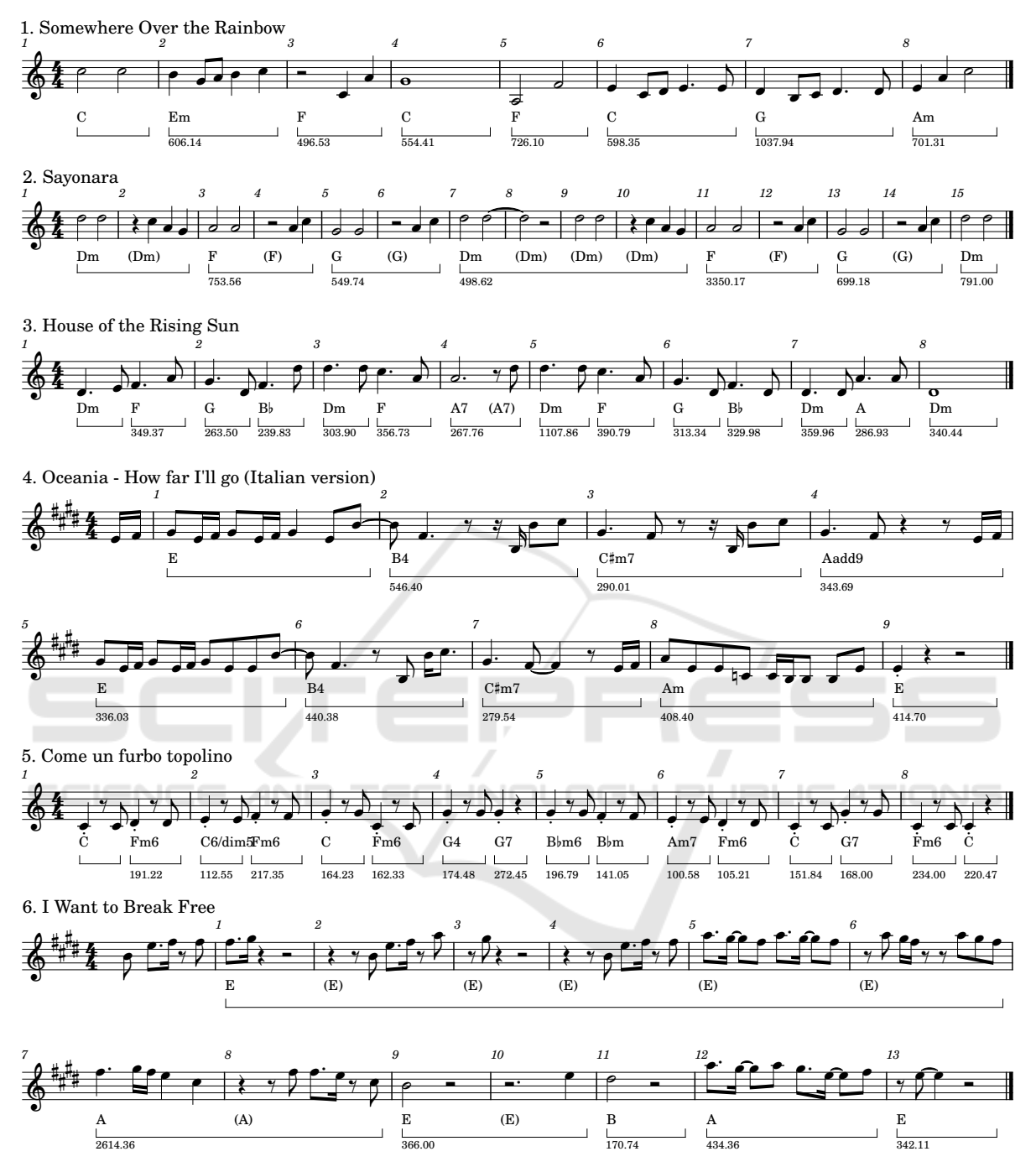
Figure 4: Scores of the songs used in the experimentation. The lines below chord symbols indicate the occurrence of chord changes and the extension of the corresponding harmonic areas. Composite rhythm is expressed by bracketed chord indications. Small numbers below indicate the mean of the absolute values of errors (anticipations and delays) expressed in ms. The first chord has no number associated since it corresponds to the initial play event, so the error is always null.