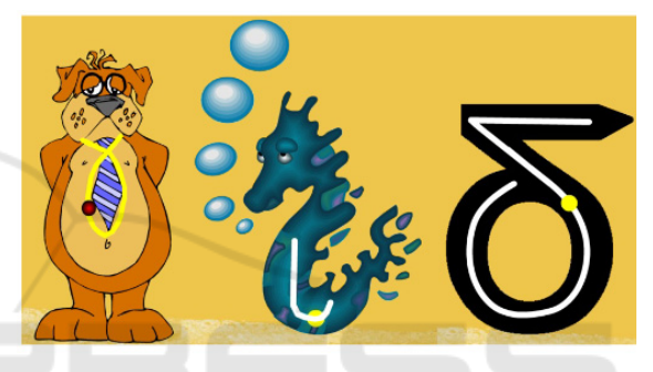
Figure 1: Example of PHAES interface.

There is a wide range of software specifically designed to assist people with learning disorders, including dyslexia. Most of such software is directed towards enhancing reading and writing skills. For such cause was developed the Phonological Awareness Educational Software (PHAES), which presents a hypermedia application for helping dyslexic readers, using phonological awareness training in Greek language (Figure 1).