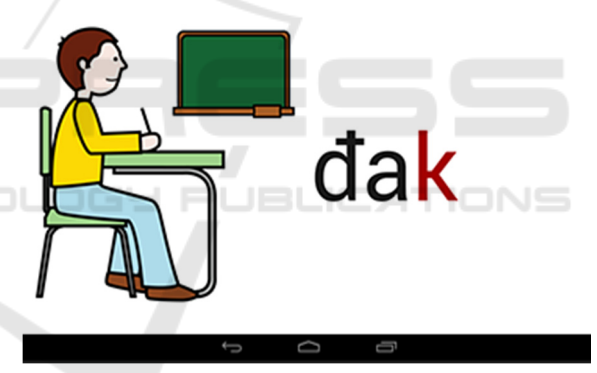
Figure 8: ICT-AAC Learning to Read interface.

Several other applications, also specifically developed for Croatian language, were designed and developed within the project named Competence Network for Innovative Services for Persons with Complex Communication Needs (ICT-AAC), a multidisciplinary project focused on ICT based augmentative and alternative communication. Different experts worked together to create iOS and Android applications, including several specifically designed for dyslexic students, such as Letters, Vocals, Memory, Learning Syllables, Learning Words, Learning to Read (Figure 8), and Language Builder.