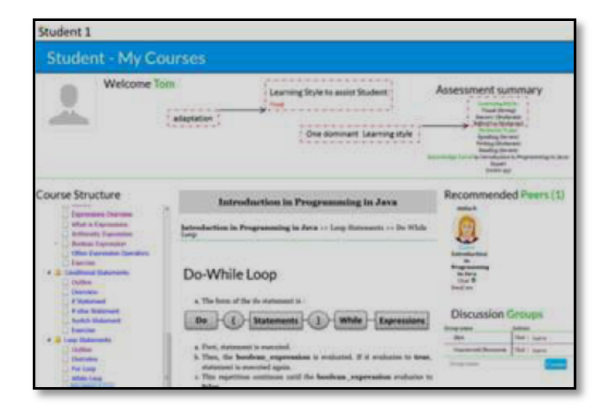
Figure 2: Learning materials implemented in DAELMS.

Experimental study (Alsobhi & Alyoubi, 2019) presented the same point using a novel dyslexia adaptive e-learning management system - DAELMS (Figure2).