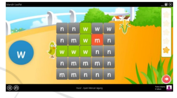
Figure 6: LexiPal: Example of gamified learning.

In addition, another learning model LexiPal (Saputra, 2015) (Figure 6) integrated educational gamification approach for dyslexic children, by incorporating seven gamification elements, namely (1) story/theme, (2) clear goals, (3) levels, (4) points, (5) rewards, (6) feedback, and (7)achievements/badges. The game elements were used with a purpose to encourage dyslexic students while granting desired psychological outcomes when they used the application, including engagement, enjoyment, and motivation.