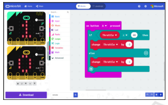
Figure 4: Example of simple block-based programming example for primary school kids.

also to most areas of everyday life. Therefore, the project cannot only be used to teach programming skills but also to establish ties to other disciplines and subjects. Building or assembling the drone could be done in handicrafts, why the drone is able to fly could be discussed in physics, and so on. This way, pupils can learn CT while engaged in a project that ideally deals with something they are interested in.