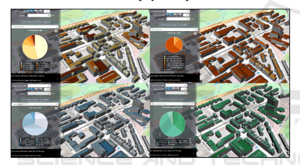
Figure 3: Visualization of PV potentials and economics; Top left: PV yield in MWh/a; Top right: LCOE in EURct/kWh; Bottom left: total investment in EUR; Bottom right: discounted payback period in years.

Figure 3 summarizes some output options of the web-based application the case study of Stöckach. Photovoltaic yields in MWh/a per roof are colored in dark red to light yellow shades (top left). The specific yield in kWh/(m<sup>2</sup>a), in the top right corner, helps to identify roofs that are particularly attractive. Dark colors indicate higher (specific) yields. The bottom left corner shows the total investment per roof (dark blue shades represent higher investments), while the bottom right section marks the discounted payback period in green. The darker the shade the smaller the value for the discounted payback period.