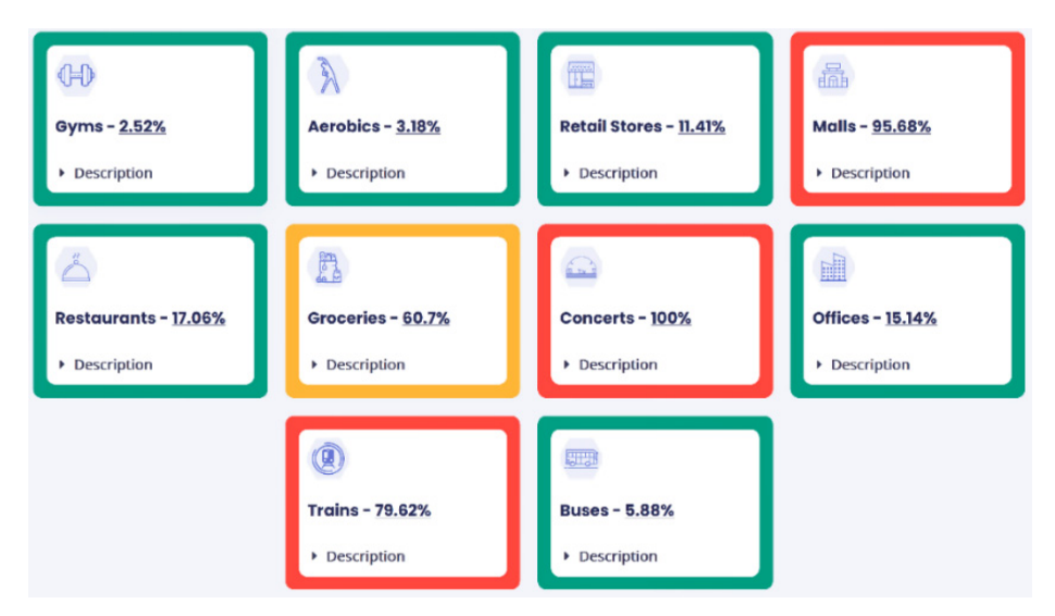
Figure 2: Example of an activity based indicator that shows the PoMSI values for all ten activities in a region for one day.