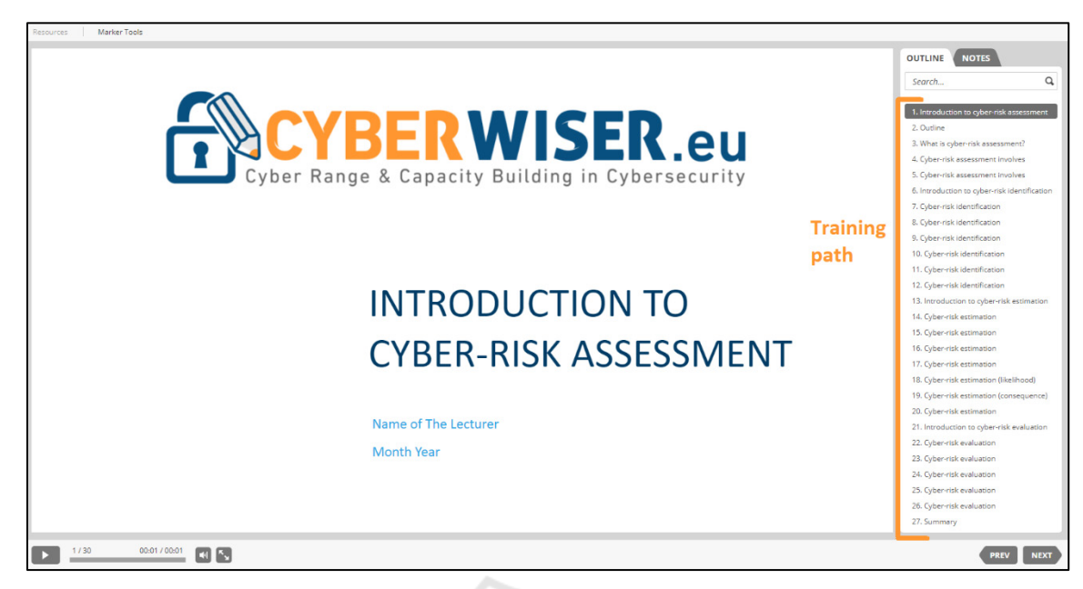
Figure 3: A screenshot from our cyber range showing the course Introduction to cyber-risk assessment.

by applying the method documented in this paper. Due to space restrictions, we cannot describe all the 22 courses. We therefore refer the reader to our public report (Gencer Erdogan et al., 2020b) in which all 22 courses and their modules are described in detail.