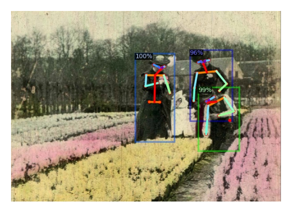
Figure 3: Visualisation of keypoint detection on a still from the Desmet collection. The coloured boxes indicate detected persons, and the detected keypoints are indicated by dots and connected to other keypoints with coloured lines.

mation can be used as a predictor of genre, but also to see whether clustering pose information would lead to a natural separation between genres. To describe pose information we extend the pose representation of (Jammalamadaka et al., 2012) to include full body, rather than only upper body keypoints. Keypoints are annotations of specific points on a human body, typically focusing on joints or extremities (e.g., top of the head, nose, elbow, hip, foot), that make it possible to describe the pose that the body is in. For this project we use the automatic keypoint detector of the Detectron2 framework (Wu et al., 2019). This detector is able to recognise up to 17 keypoints which makes it possible to capture a wide variety of poses. While the project is still ongoing, the initial analyses (as illustrated in Figure 3) show that this keypoint detection approach is sufficiently robust for applying it to historical material, highlighting the feasibility of using AVP techniques for historical film analysis.