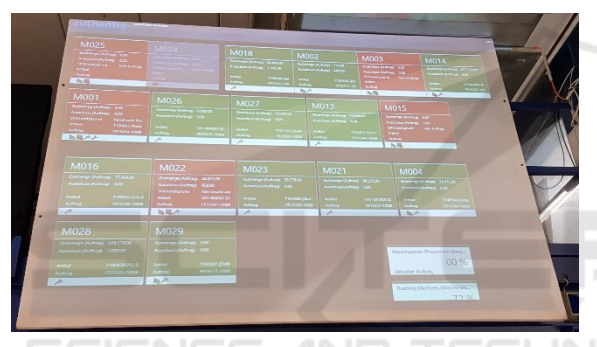
Figure 3: Organizational transparency by use of a manufacturing info-board.

The observed examples within the empirical field are manifold. For example, the managing director of an involved company specialized in injection moulding foster the motivation for the Digital Transformation of its employees by internal value services: increased transparency of manufacturing processes by use of a manufacturing info-board (c.f. figure 3). A further company equips its service employees with Virtual Reality Glasses to easily download construction plans during services processes at the customer. Additionally, by use of the VR Glasses, the service employees are able to get connected with the headquarter and to receive real-time support and advices.