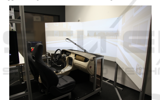
Figure 4: Data capture setup with a Kinect AZURE fixed at the front of a driving simulator.

CycleGAN does not require paired input images from source and target domain for training and therefore is ideal for our requirement as in our experiments we do not have access to paired synthetic and real depth images for the same scene, for example, in the form of real depth images captured using a depth sensor and synthetic depth rendering of the same scene acquired from a depth simulator. Moreover, the cycle consistency imposes a stronger constraint than a standard GAN with only reconstruction loss to bring the mapped image closer to the real image domain.