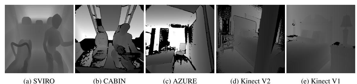
Figure 3: Example synthetic and real images used for image translation and domain adaptation.

CycleGAN does not require paired input images from source and target domain for training and therefore is ideal for our requirement as in our experiments we do not have access to paired synthetic and real depth images for the same scene, for example, in the form of real depth images captured using a depth sensor and synthetic depth rendering of the same scene acquired from a depth simulator. Moreover, the cycle consistency imposes a stronger constraint than a standard GAN with only reconstruction loss to bring the mapped image closer to the real image domain.