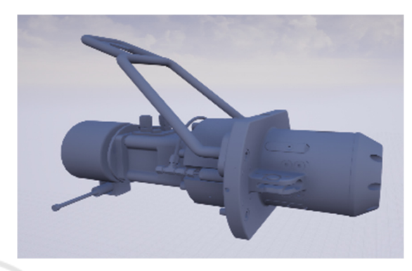
Figure 2: Object 1 (STEP file with approximately 230K entities).

For smaller files, Datasmith seems to perform well when importing, compared to the developed application. This is mainly because CADto3D requires two import processes (from the STEP file to the application and from the FBX to Unreal Engine).