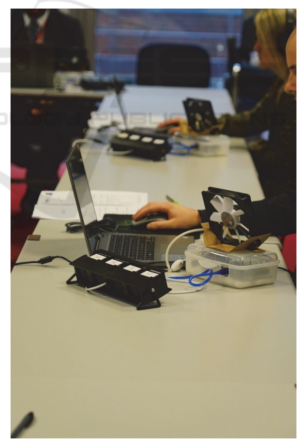
Figure 1: Students learning in Mulsemedia Lab.

Until the NEWTELP platform came into existence, mulsemedia was not really considered as a possible TEL method as it was used mostly in entertainment (Covaci et al., 2018). The NEWTELP platform which was built in the context of the NEWTON project introduced this novelty, based on past pedagogical experiences and theories that encouraged learning in a multi-sensorial environment (Broadbent et al., 2018).