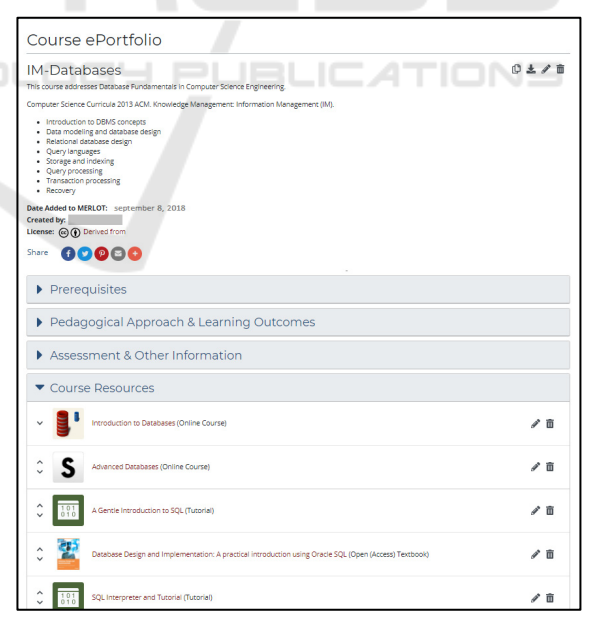
Figure 2: ePortfolio for Fundamentals of Databases.

Figure 2 shows a screen capture of the Course ePortfolio named IM-Databases, which have been created by the professor for the Fundamentals of