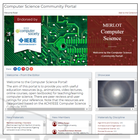
Figure 1: MERLOT Computer Science Community Portal.

As a way of example, some screen captures of the steps described are presented. Figure 1 shows a screen capture of the MERLOT Computer Science Community Portal.