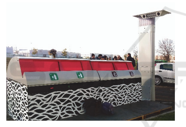
Figure 4: Outdoor prototype for private test.

Different changes in order to improve the user interface, the inner volume of containers, the resistance to weather conditions, and other details were made during the private outdoor test.