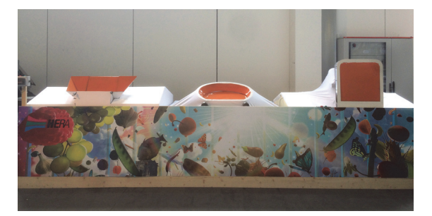
Figure 3: Indoor prototype of three opening lids.

At the beginning of 2017 Next City Lab Group presented a 1:1 scale prototype of the three most promising options of containers, suitable for indoor test, and a mock-up of a smart totem, an innovative element integral part of the waste collection station.