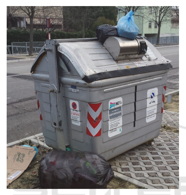
Figure 1: The standard model of container lid, a recycling cap with several criticalities in terms of user experience.

Littering or putting the wrong materials in the recycling bins lower the quality of separate collection and rises recycling costs.