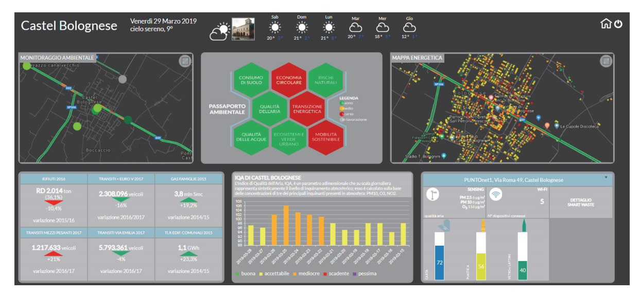
Figure 6: Pilot urban dashboard for a 10 000-inhabitant town, Castel Bolognese demo site.