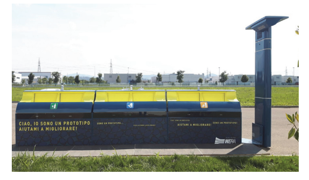
Figure 5: Outdoor prototype for public test.

The second outdoor prototype was specifically meant for a public test in a real world urban context: 40 families of Castel Bolognese, an Italian town at roughly 10 000 residents, started testing PUNTOnet on October 2018. The testing stage ended on the 20th October 2019.