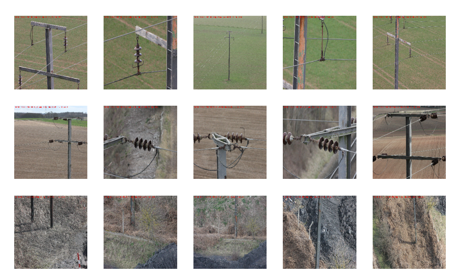
Figure 2: Examples of test images that were correctly classified. Top: S class. Middle: T class. Bottom: U class.