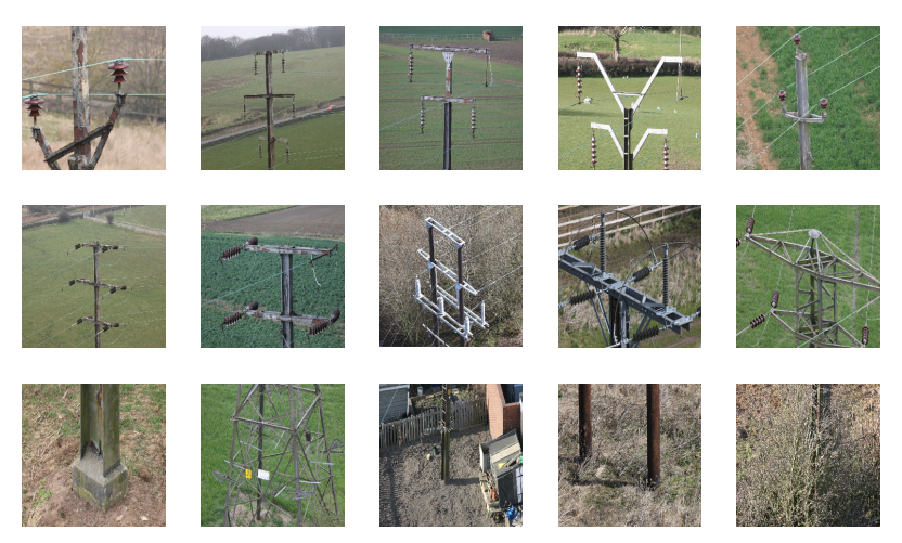
Figure 1: Top: images of S-type towers. Middle: images of T-type towers. Bottom: images from which tower type is not apparent.