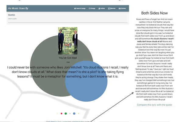
Figure 3: Comparing movie quote with song lyrics.

easy to use than the ones where the compaisons where made in the context of both movies (task 6.2) or songs (task 7). So, post-evaluation: these comparisons (illustrated in Fig.1f-h), are done in the context of both movie and song (Fig.1h). Here the quote "Its clouds illusions I recall" in the dialogue from You've Got Mail movie is compared with the lyrics of Joni Mitchell's song "Both Sides Now" that includes this quote, common text highlighted in bold. S in the other comparisons, the user will also be able to view, and cycle through other results featuring the searched quote or part of it (exemplified by "Change comparison 1/3 >" beneath the song).