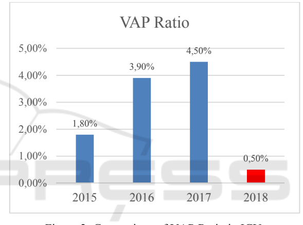
Figure 2: Comparison of VAP Ratio in ICU.

Following a full year of implementation of the new nursing care plans triggered by the CDSS, the rate of new cases diagnosed with VAP decreased from 4.5% in 2017 to 0.5% in 2018 (Figure 2).