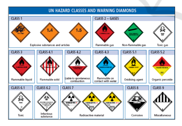
Figure 3: Dangerous Goods Classification.

Except for general container, other types of container are under different special treatment and conditions. As for dangerous goods, they are articles or substances which capable of posing a risk to health, safety, property, or the environment when transported by air. To ensure the safe transport of dangerous goods by air, requirements are set in place for both shippers, freight forwarders and air operators. These Classes and divisions have characteristic danger labels (aka warning diamonds) as shown in Figure 3.