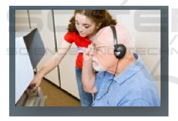
Figure 1: Web Application guided by an instructor.