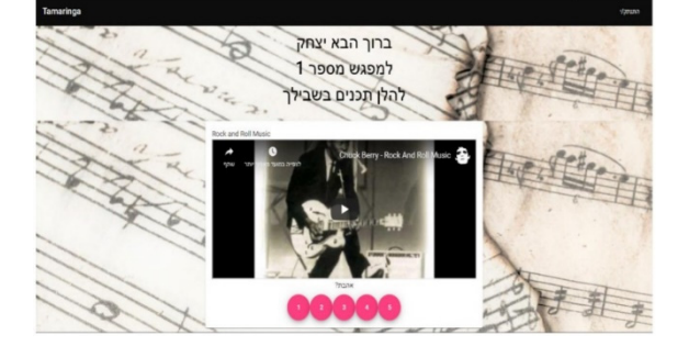
Figure 2: Suggested playlist with buttons to rate the song.