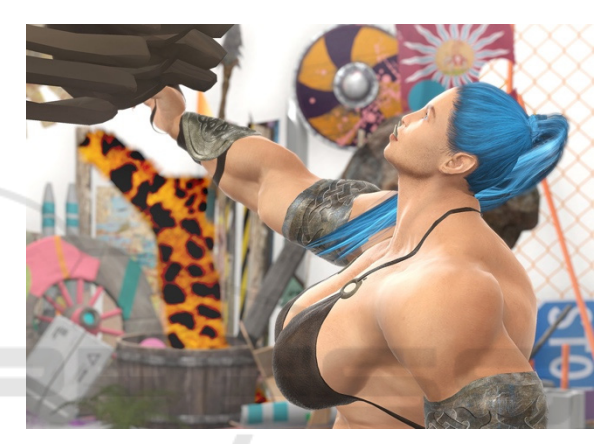
Figure 4: Theo Triantafyllidis. Painting (Gamescenes, 2019).