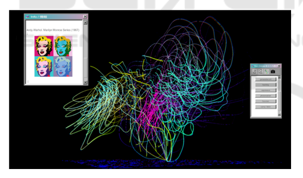
Figure 2: Art Space. Generative art room with the antecedent, Marilyn Monroe series by Andy Warhol (screenshot, 2020).