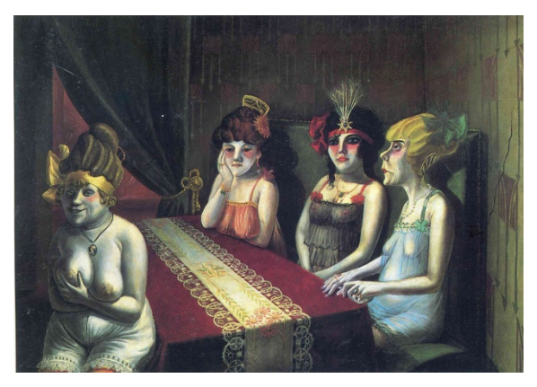
Figure 3: Otto Dix, Salon 1 (1927) (Bibliokept, 2014).