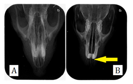
Figure 1: Radiograph image of rats alveolar bone (A) healthy rats; (B) periodontitis rats; Yellow arrow showed bone resorption.

treatment blood sugar levels. The rats were euthanized using ether and the anterior maxillary gingival tissues were carefully extracted and stored in 10% formalin solution.