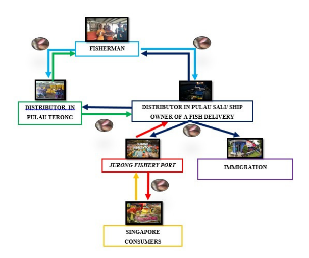
Figure 2: Marketing channel.

Marketing Channels are formed from the relationship between producers, consumers and intermediary traders. Marketing channel for grouper in Pulau Terong involves fishermen to the consumer that described in the picture below: