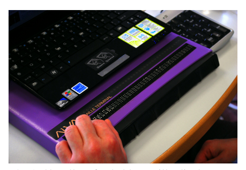
Figure 2: A 40-cells refreshable Braille display.

and automatic recognition algorithms can help. Many operating systems integrate their own screen readers and speech synthesizers: e.g., Orca for Linux, Narrator for Microsoft Windows family, and VoiceOver for Apple macOS.