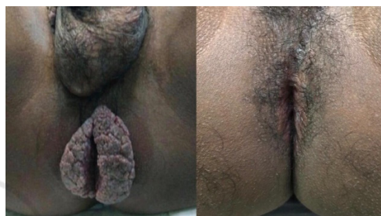
Figure 1. A. Pre-operative status of the disease. B. The postoperative result after electrodesiccation and curettage (four months post-treatment)

The prognosis of this patient was quo ad vitam and quo ad sanam dubia ad malam. Due to the inability of the immune system against the entry of pathogenic effectof HIV infection.Furthermore, any STI that the patient suffers from can get worse, recurrent or resistant, and the possibility of developing another life-threatening infection is higher.(Mudrikova et al,2008) Quo ad cosmeticam wasdubiaadbonam. Due tothe complete removal of all lesions and a low risk of scarring.