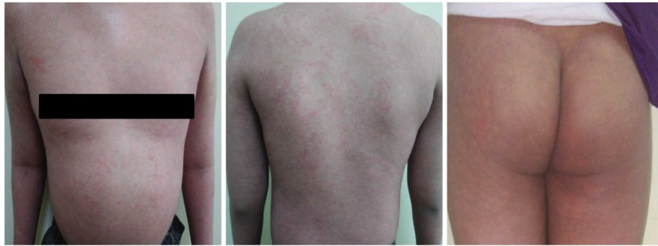
Figure 2. Clinical improvement after one-week administration of cyclosporine and topical desoximetasone Discussion

Diagnosis of generalized pustular psoriasis was made based on history taking, physical and dermatology examination, laboratory, and histopathology examination.