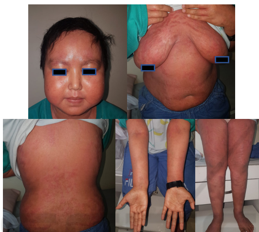
Figure 4. Improvement in both moon face and skin lesions after 3 months.

improved a lot up until now (Figure 4). Currently her oral steroid is still tapered off, changing back to methylprednisolone 3 mg and 2 mg every other day. Her gynecology ultrasound revealed uterus and ovarium hypoplasia and low level of LH 0.8 mIU/mL, normal level of FSH 6.7 mIU/mL, normal level of estradiol 16.6 pg/mL, and normal level of anti Mullerian hormone 1.39 ng/mL. She still has not had her period and currently on obstetrician-gynecologist supervision because her clinical and laboratory studies did not add up.