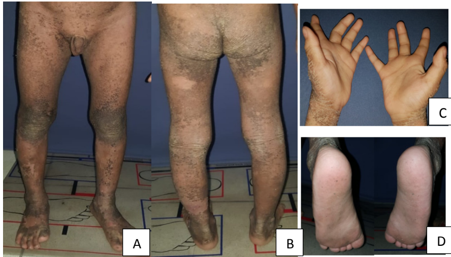
Figure 2. Clinical manifestation. A,B. Hyperkeratotic warty plaques widely spread over the lower limb with areas of superficial erosion C,D. Sparing palms and soles