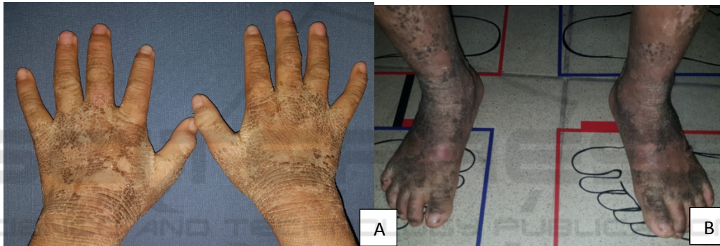
Figure 3. Clinical manifestation. A,B. Dirty brown, cobblestone, hyperkeratotic plaques over the posterior of hand and feet

Histopathology from an area of hyperkeratosis on his left knee showed massive hyperkeratosis, acanthosis of stratum malpighi, spongiosis, lysis and clumping of keratinocytes in the stratum spinosum to stratum granulosum. Lymphocytic cells are seen around blood vessels. The findings were consistent with EHK. (Figure 4 A-C)