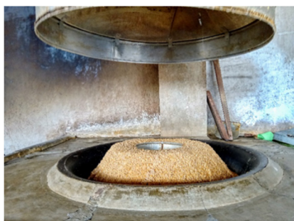
Figure 5: The Process of Soybeans Boiling, Doc. Researcher Documentation

As for the changes, according to Fany not so much. What stands out is the source of raw materials. In the past, of course we used local soybeans, while now we have used soybeans from the USA. The purchase from outside was due to domestic soybeans being unable to meet production needs. The need for soybeans for one production is one quintal and within 1-3 months one can buy soybeans in the amount of several tons.