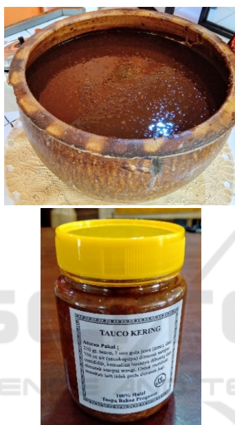
Figure 7: Wet and Dry Tauco ready sale. Doc. Researcher Documentation

The main difference between Tauco Cap Biruang compared to other Tauco products is the sweet taste. While most of Tauco products are salty, Tauco Cap Biruang is unique in having two variants, sweet and salty. This is done to reach consumers who don't like the taste of salty and or sweet. In this way, the Tauco Cap Biruang industry can become one of the local Tauco industries that can match the Tauco Cap Meong industry.