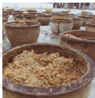
Figure 6: Salting and Storing in Patiman Process. Doc. Tauco-Cap Meong's Documentation

The next process is to rip the soybean called as ' dipeuyem ' for three days and three nights, then dry again to dry. Then the most important step is storing in Patiman and salting. The purpose of this process is for the preservation process. If the weather is hot, two weeks in Patiman will suffice, but if the weather isn't hot enough, storage can be up to two months. Then it can be taken for dried Tauco stock. The last stage, if you want Tauco wet, the cooking process needs to be added again about 2-3 hours to mix it.