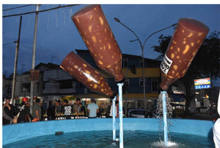
Figure 1: Tauco Monument in Cianjur.

Cianjur, West Java, but who would have thought, Tauco is a culinary originating from China. From the origin of the word, Tauco comes from its pronunciation in the Hokkien dialect of Chinese. The Chinese Tauco character is written as "豆醬," which consists of tau "豆" which means beans, co "醬" which means thick soy sauce. Tauco is known as a seasoning made from soy fermentation preserved with salt.