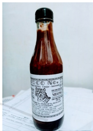
Figure 4: Tauco Cap Meong Packaging, Doc. Researcher Documentation

Meong a role model, including production techniques to packaging. This last part is the reason why Tauco Cianjur's packaging looks almost the same. Namely with the formula, the name of the animal, with the animal in the middle as a logo, and only on black and white paper. It will be difficult to distinguish between Tauco Cap Meong, Cap Biruang, or Cap Harimau. But on the other hand, it was also what later made Tauco from Cianjur very distinctive, well-known and easily recognized by the wider community.