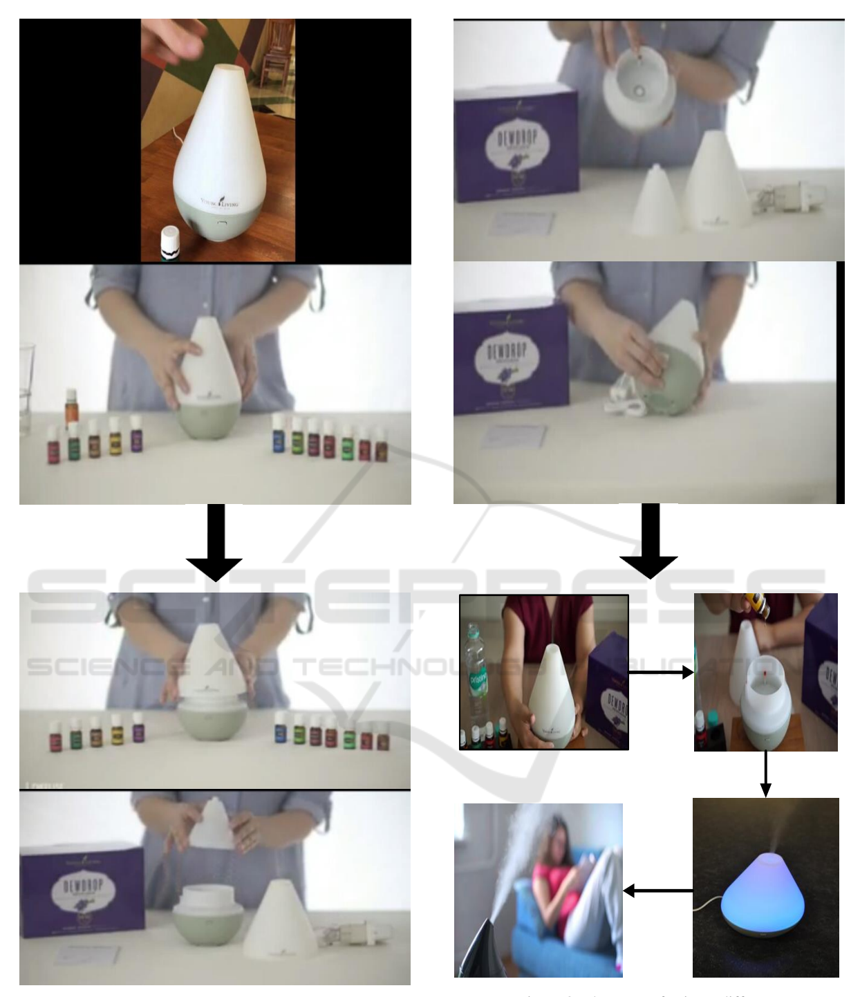
Figure 2: Image of a diffuser tool and how to open it.