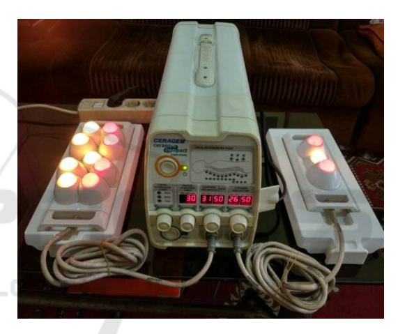
Figure 2: Ceragem Therapy Tool

This is a Ceragem therapy tool that is used for patients who have gout complaints, this tool is very easy to get because it can be ordered directly to the Ceragem therapy center or can be ordered via online