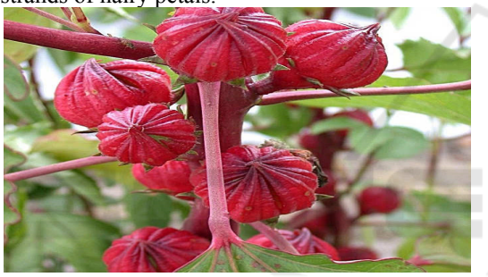
figure1. rosella flower

Rosella is an annual herb that can reach heights of 0.5 - 3 m, round, woody, and red stems. Single leaf, egg-shaped, looping fingers, blunt edges, jagged edges, and grooved base. The leaf length is 6 - 15 cm and the width is 5- 8 cm. round leaf stalks green with a length of 4-7 cm. Roselle flower is a single flower that comes out of the axillary leaves that fall within 24 hours after blooming, on each stem there is only one flower. Flowers have 8-11 strands of hairy petals.