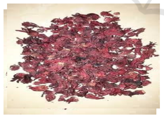
figure2. Dried Rosella flower

The process of drying rosella flowers can be done naturally or artificially. Naturally, rosella petals are dried by being spread out on palm trees or bamboo tkar, so they don't get sunburn which causes their quality to decrease. Drying is done in the morning at 09.00 - 11.00 noon and afternoon at 14.00 - 16.00.