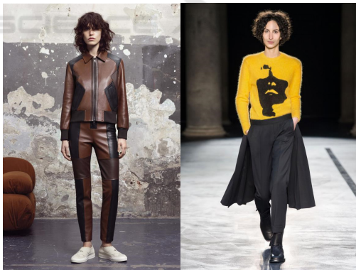
Figure 1: Neil Barrett Fall 2016 Ready-to-Wear Collection. Italy. Designer: Neil Barrett.

Today, with his own label, Barrett manipulates textiles to create sculptural silhouettes with a masculine aesthetic. He took to "emptying" the fabric to preserve the construction but reduce weight, essentially conjuring garments as comfortable as travel clothing, and whipping up new surfaces. For 2017 fall, he introduced his version of an ecologically friendly "fur," digitally printing a photograph of a black and a brown bear and multiplying it on various pieces — a duffle coat, a sweatshirt, a bomber. "I tried real fur, but it looked too retro, and eco fur was so pantomime," Barrett said, "explore further fabric innovation. Every season I'm like: What's next?"