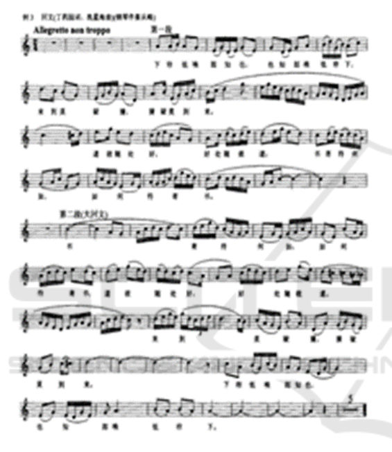
Figure 5: 回文.

Xian Xinghai's creations in his works all use big palindromes instead of small palindromes. For example, in the second paragraph of the song, the music material of the first paragraph was used to create retrograde writing in units. It's a typical big palindrome.