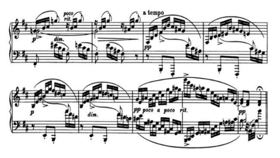
Figure 2: Part of Schumann theme variation.

Many mirror Canon or palindrome song creation techniques are to move the "mirror" position. When the "reflective surface" of the "mirror" is a whole, what is formed is the retrograde of the music, which is like Mozart's "The Mirror Duet for Violins" playing from the end. When the "reflective surface" of the "mirror" is up and down, the resulting music is Inversion. For example, Brahms's "Schumann theme variation". The external voice of the work uses the technique of reflection.