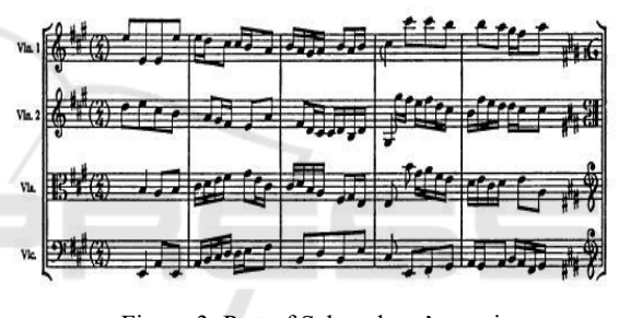
Figure 3: Part of Schoenberg's music

When a "mirror" is placed in two different directions at the same time, a reflection is retrograde. It is also a basic technique for creating sequence music. For example, Schoenberg's retrograde reflection of the Canon String Quartet in "Style and Creativity". This writing is an excellent exercise for the composer's ability to control the part of the voice. Schoenberg likes this practice.