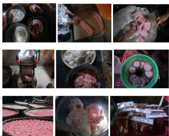
Figure 1: The Process of Making Rangining from Cassava Based Product

curious about the process of making the cassavabased products. There are many kinds of cassava products made by the people in Creundeu hamlet, such as Rasi, noodle, cakes, chips, and many more. The problems occurred when the foreign tourists asked how to describe the products, the ingredients, and the process. Considering the findings from the observations, the people do not know how to describe the product and the production process in English. Here are the processes of making one of the cassava-based products.