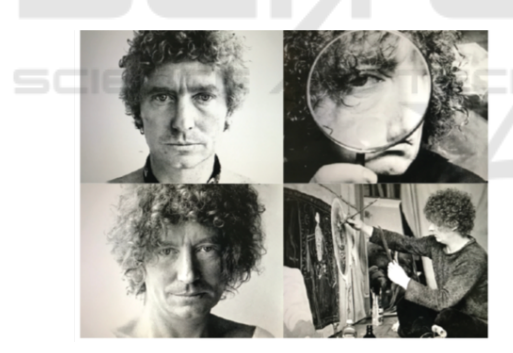
Figure 2: Black and white self-portrait of Whiteley

In the first scene, this documentary reveals montage sequences of black and white, and colourful pictures (see figure 1) to introduce Whiteley, telling when and where he was born. According to Frierson, 'montage in the broad sense describes a series of short shots that compress time, space, or narrative information, but it actually has several distinct meanings' (2018, p. 206). Montage sequences can be used as one of the additional elements to assist the visual aesthetic. (Leibowich, 2019) supports the notion that montage can be utilized as a device for creating spatial and temporal correlations within a movie.