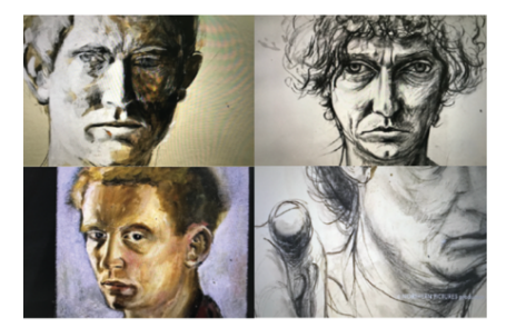
Figure 1: The opening visual od Whiteley documentary film

photographs, and other materials that support his concept (IMDb n.d).