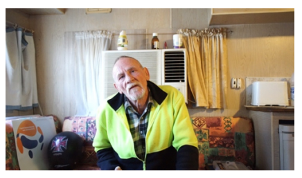
Figure 4: Original clip of his partner story

Figure 3, 4, and 5 were the original clips of the documentary film. It can be seen that each clip had different brightness and color grade. Figure 3 had overexposure lighting on the right side of the subject. Every time he moved, the brightness changed