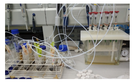
Figure 2: Soil supernatant was flowed through SPE cartridge for absorbingmetsulfuron methyl.

For the extraction of metsulfuron methyl in the soil, 5 grams of soil sample were prepared, then mixed with 0.1 M NaHCO<sub>3</sub>. The samples were shaken with orbital shaker (200 rpm, 2 hours). After that, they were centrifuged for 20 minutes at 4000 rpm. The SPE cartridge was rinsed with 3 ml of acetonitrile and 3 ml of distilled water. The supernatant resulted was flowed about 2-3 ml per minute through the SPE cartridge (Figure 2). Then, metsulfuron methyl absorbed in the SPE cartridge was separated with methanol and stored in a 20 ml glass bottle. The extraction results were dried to a range of 1 ml. After that, it was sucked with a syringe equipped with a 0.2 micron filter, then transferred to a 1.5 ml analysis vial bottle.