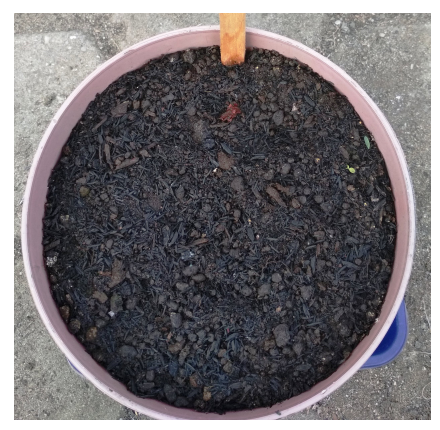
Figure 1: Mixture of soil and rice husk biochar.

The soil with the same treatment was composited, stirred evenly, aerated for 2 hours then taken as much