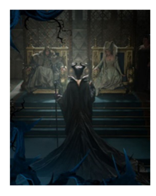
Figure 1: Maleficent Costumes