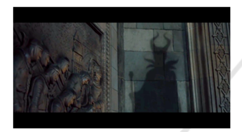
Figure 4: Screen shot Shadows of Maleficent