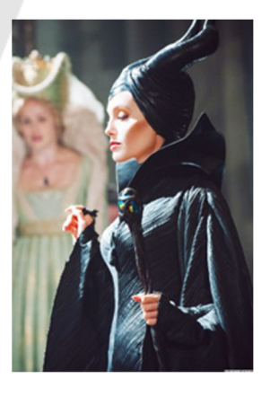
Figure 3: Maleficent Costumes