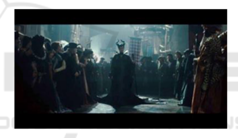
Figure 2: Screen shot costume Maleficent full shot from front