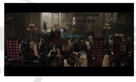
Figure 8: Screen shot Extracas of guests and the people