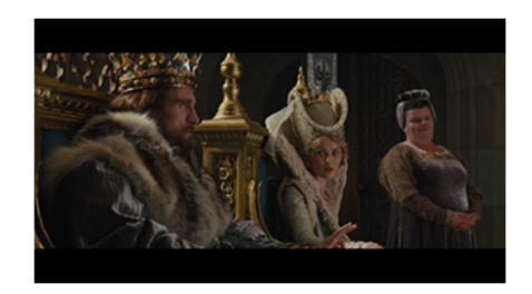
Figure 7: Screen shots of King Stefan and Queen