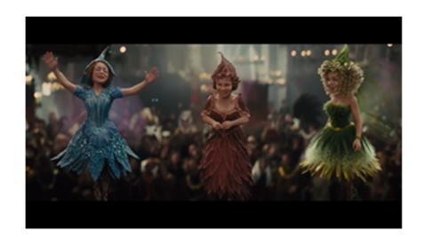
Figure 11: Screen shot Three Little Pixies come

Vontage The hustle of the palaces filled with invited guests from around the country to give blessings and congratulations to King Stefan and his wits for the birth of their babies. Three Flower Pixies come to congratulate the King Stefan as well as give gifts to the baby Aurora