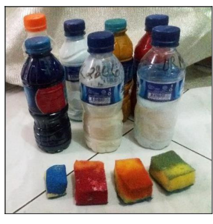
Figure 1: material and tools used in engineering repeated staining.

Bleaching Material used: plate mould, bleach, paper clip, a board the size of a plate.