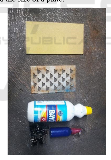
Figure 2: Materials and tools used to bleaching techniques.

Bleaching Material used: plate mould, bleach, paper clip, a board the size of a plate.