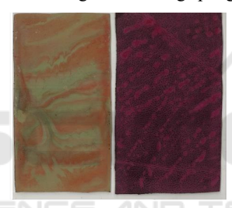
Figure 4: Results of Experiments recolouring to pour paint and sponges.

a. Recolouring / Recolour Techniques such as using or setting pour paint motif pattern using dishwashing sponge foam.