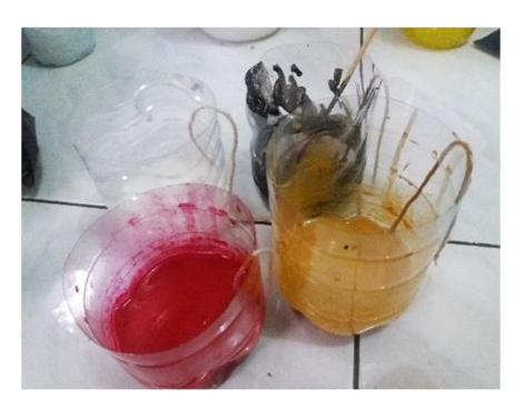
Figure 3: Materials and tools used in pull technique thread.