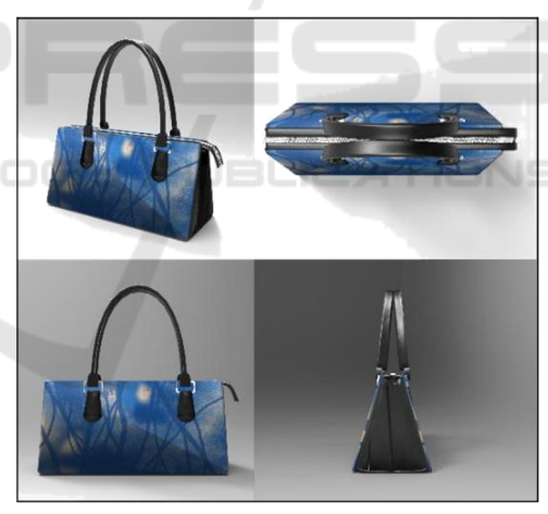
Figure 7: Bag design and development results application to the bag. Source: author.

Stage model studies in this study using a model class 1. In class model 1, the product model is made of rubber material models