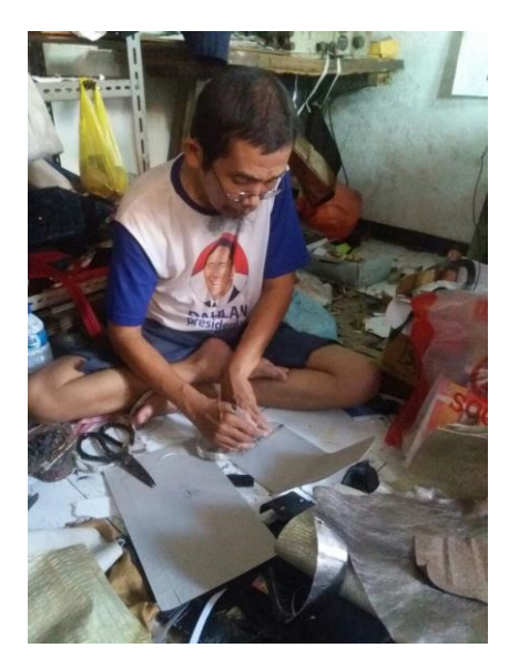
Figure 8: Bag production process.