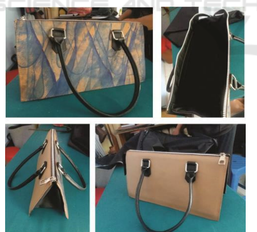
Figure 9: Implementation of experiments on the type of hand bag ladies handbags.

This research theme ladies handbag as the implementation of the experimental media. The concept of adaptation of the theme that is elegant, long lasting, and unique. The following types of handbag into implementation: