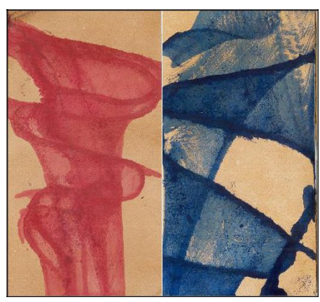
Figure 6: Results of Experiments with pull technique yarn.

Mechanical pull the thread using basic material cowhide crust (60%) and the use of skin pigment.