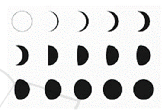
Figure 10. Moon Phase Shape Simplification

Mix Material Test Result. In the mix material test, author combining leather material with silver is used. The selection of silver material was assessed according to the jewelry design concept named Lunarian. A series of jewelry inspired by the elegance of the moon. The basic form of jewelry is also a stylization and simplification of the formation of the moon phase.