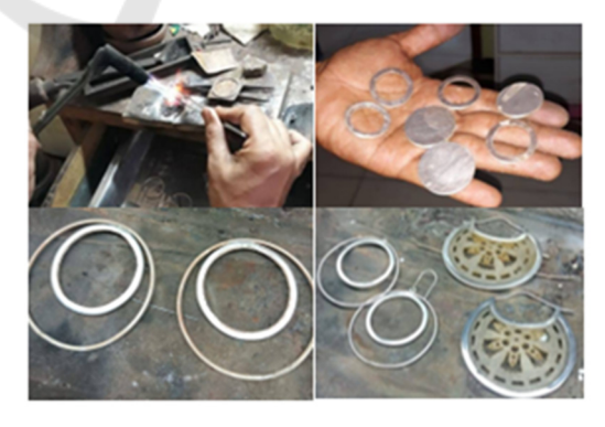
Figure 11. Jewelry Making Process

The following pictures documented the process of making silver parts in jewelry, the technique is framing the post laser cut leather leftover material. The making begins by processing the silver plate into parts of the frame and then uniting and finishing. After that, then the skin is inserted and then assembly the jewelry.