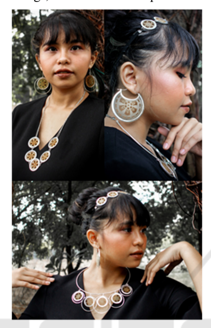
Figure 12. Lunarian Jewelry Set

Final Design Product Photography. This Following figure is the prototype of Lunarian Jewelry, including sets of earrings, necklace and headpiece.