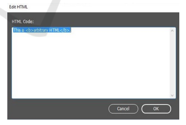
Figure 3: InDesign editor to insert and edit HTML.

The only possible way to proceed is using the function "insert Html", which allows the operator to enter HTML and insert the requested code for the interactive elements in order to create an interactive object: Each file is included in the tag <object></object>. This function makes the exportation time slower and it is not possible to verify if the elements work until the exportation ends.