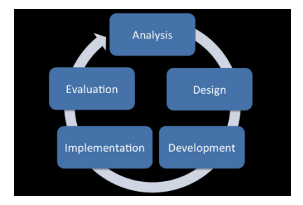
Figure 5: ADDIE model diagram (Educationaltechnology. net, 2017).

The formative assessment is done at all stages and is done during implementation with both trainers and students. The summative assessment is done after the implementation phase ends and serves to improve the program based on the results.