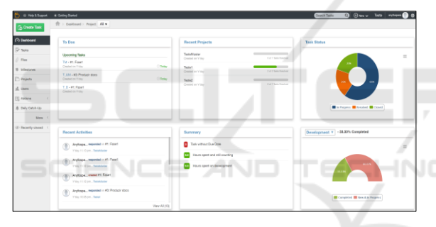
Figure 2: Interface of OrangeScrum.

Figure 2 shows the interface of OrangeScrum.