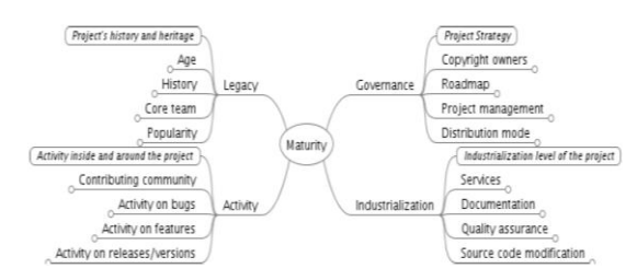
Figure 4: Maturity criteria of a project (Semeteys, 2013).

Figure 4 shows the maturity criteria proposed by QSOS methodology.