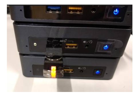
Figure 2: 3 Intel NUCs with one attached Dongle.