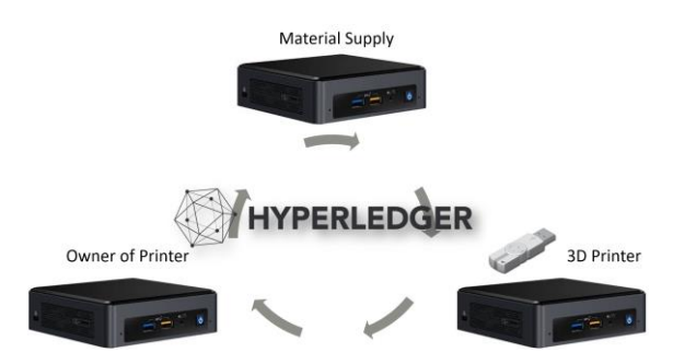
Figure 1: Blockchain-based value chain (with Dongle).

seamless and tamperproof recording of real-world activities.