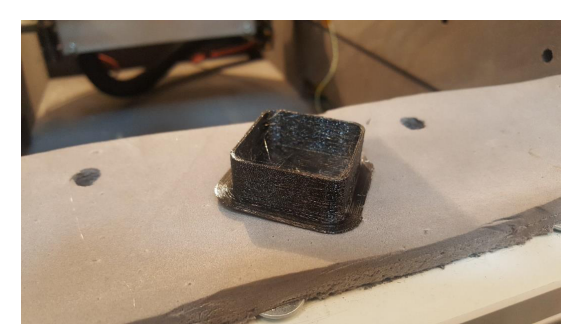
Figure 7: Sample part manufactured during the user tests.

would be exactly the same because it only guaranteed the upload of the file selected by the user and gave the order to the controller to begin its execution.