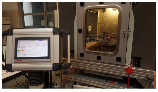
Figure 6: Working version of the I-AM HMI.

As it can be seen, the interface can be divided into three main groups of use. The upper group contains process control information, that is, it allows the user to monitor in real time the position of the axes,